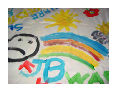
Art from workshops