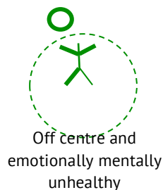
Off centre and emotionally mentally unhealthy